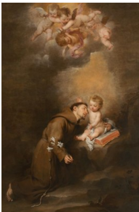
St. Anthony of Padua with the Child, Bartolome Esteban Murillo, 1665, Museum of Fine Arts of Seville, Spain

Saint Anthony was born in 1195 in Lisbon, Portugal to a wealthy family and given the name Fernando Martins. Around the age of 15, he gave up his future of wealth and power and asked to be sent to the Abbey of Santa Cruz, located in the then capital city of Coimbra in Portugal. Following his ordination to the priesthood, he sought a life of solitude, devotion, and study of the Holy Scriptures.